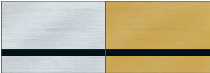
LM63-1224 Brushed Silver/Black

A flexible magnetic material used to create promotional magnets, repositionable nameplates, vehicle graphics, and more.