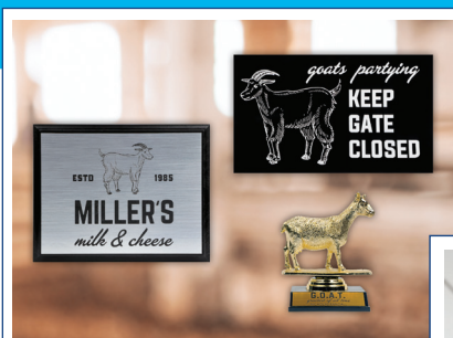
^ LaserLIGHTS Sign Kit